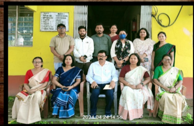
অধ্যক্ষ মহোদয়ৰ সৈতে শৈক্ষিক বিষয়াসকল