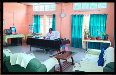
অধ্যক্ষ মহোদয়ৰ কাৰ্যালয়