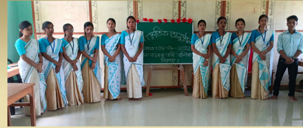
PERFORMANCE OF CHORUS BY OUR TRAINEES