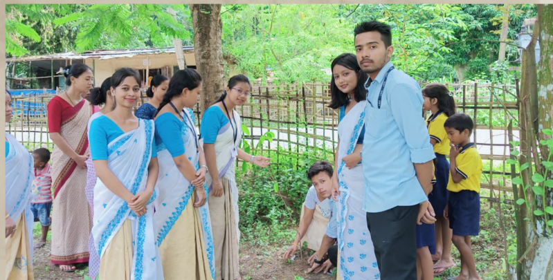
PLANTATION AT ASSIGNED SCHOOL