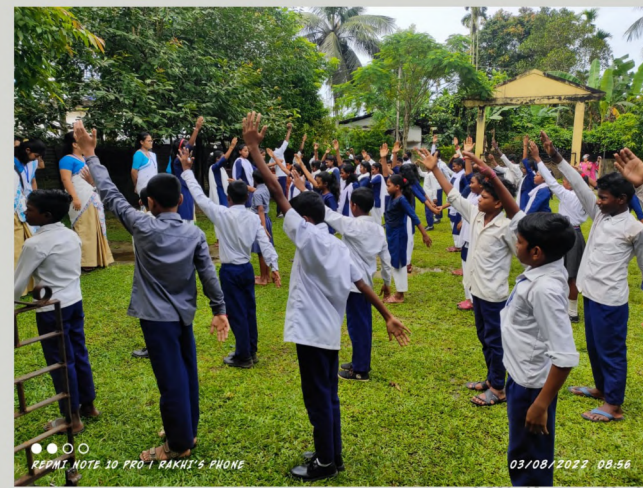
PRACTICE OF PHYSICAL ACTIVITIES AND DRILL