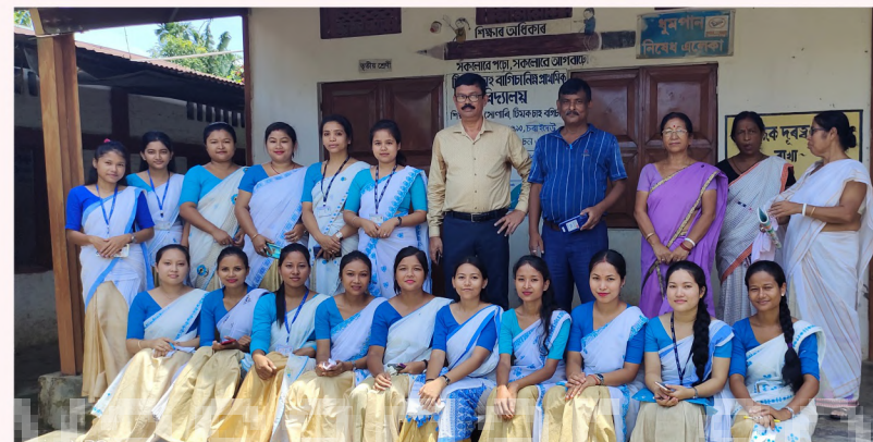
TEACHERS, TEACHERS TRAINEES WITH THEIR MENTOR