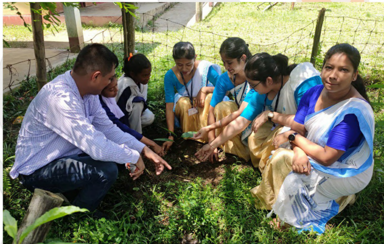
TEACHER TRAINEES DURING TREE PLANTATION