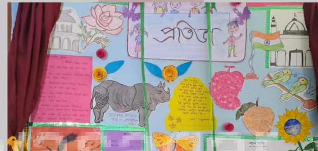
WALL MAGAZINE DISPLAYING THE TALENTS OF THE STUDENTS OF THE SCHOOL