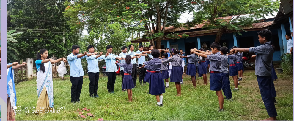
PHYSICAL ACTIVITIES ARE GOING ON