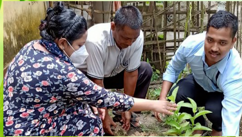
TREE PLANTATION DONE BY THE TRAINEE, MENTOR AND HEAD MASTER OF THE SCHOOL