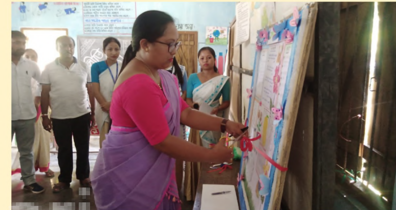
INAUGURATION OF WALL MAGAZINE