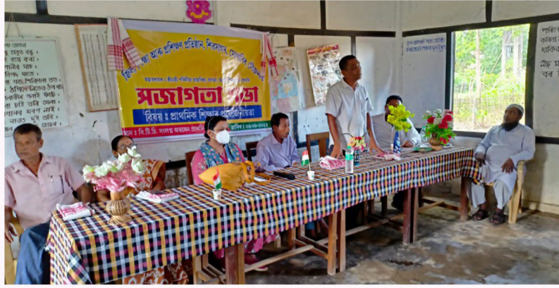
IMAGE OF XOJAGOTA XOBHA