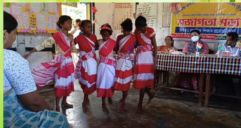
JHUMUR PERFORMED BY THE STUDENTS OF THE SCHOOL DURING THE CLOSING CEREMONY OF SIP