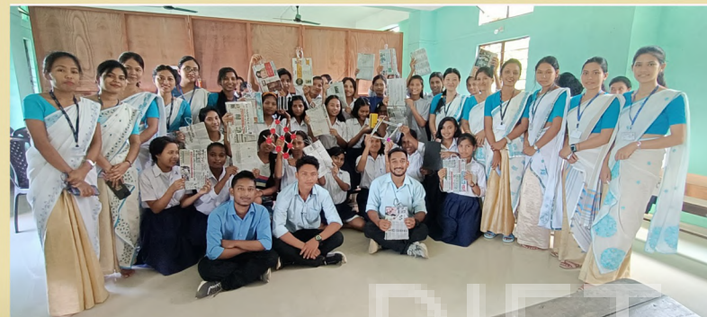
DEMONSTRATION OF SELF MADE ARTICLES BY THE STUDENTS