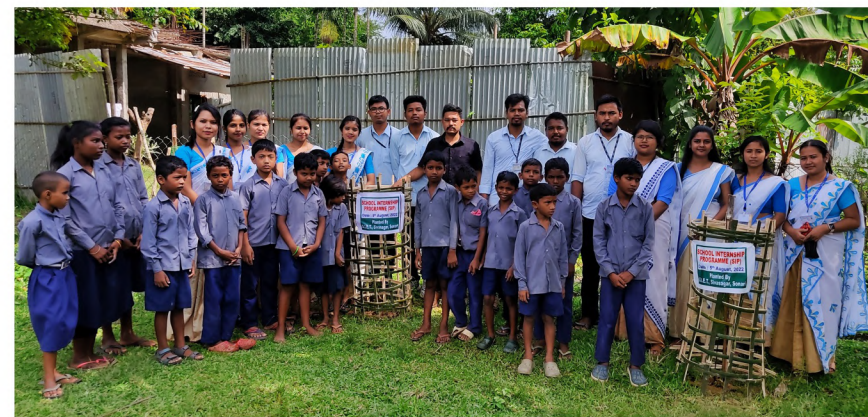
MENTOR WITH THE TRAINEES AND STUDENTS DURING TREE PLANTATION IN THE SCHOOL