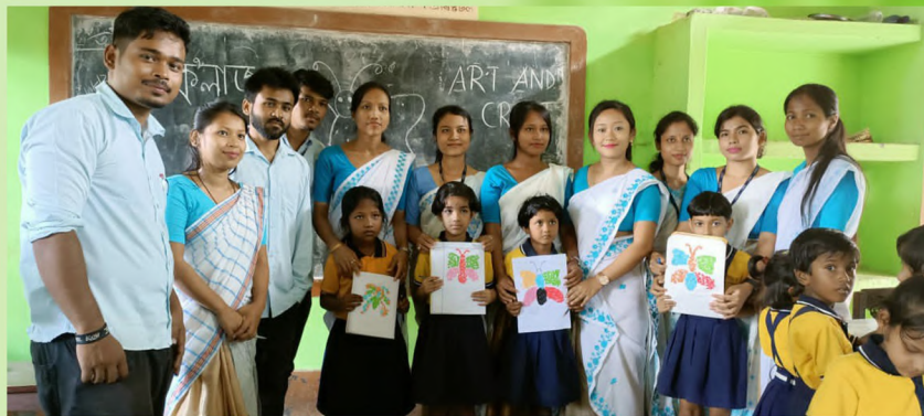
COLLAGE ART PREPARED BY STUDENTS