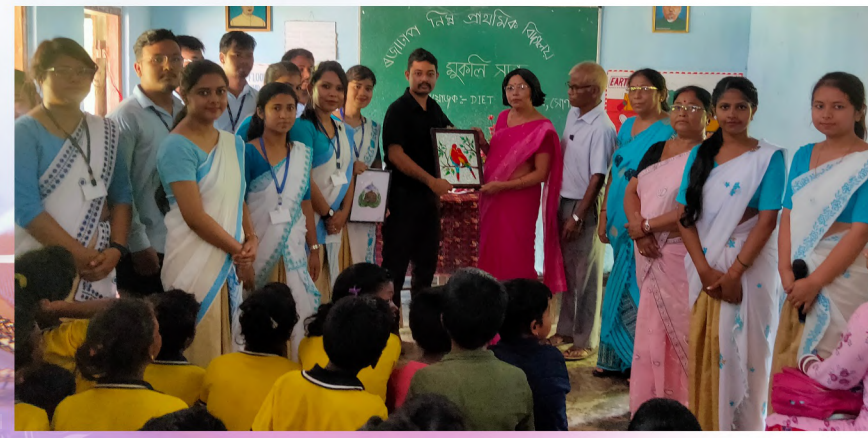
CLOSING CEREMONY OF SIP