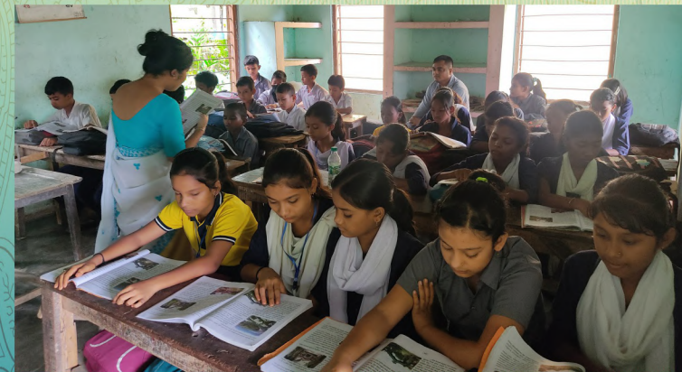
CLASSROOM TRANSACTION IN PRESENCE OF MENTOR