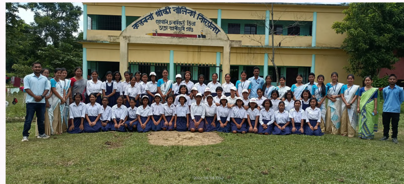
A PICTURE OF STUDENT, TEACHER TRAINEES AND MENTOR