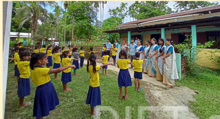
CONDUCTING MORNING ASSEMBLY DURING SIP