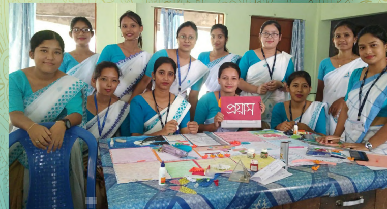
AT THE TIME OF PREPARING THE WALL MAGAZINE