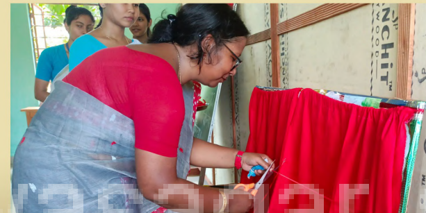
INAUGURATION OF WALL MAGAZINE