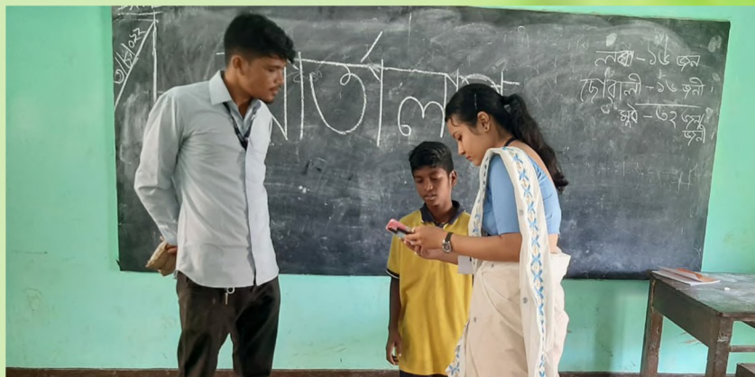
INTERACTION AND DIALOGUE WITH STUDENTS