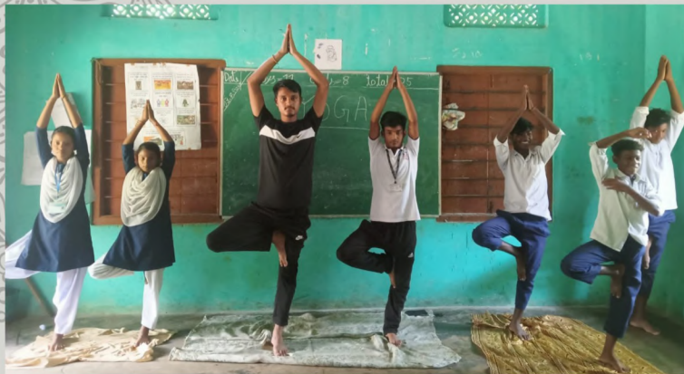
YOGA CLASS CONDUCTED BY OUR TRAINEES