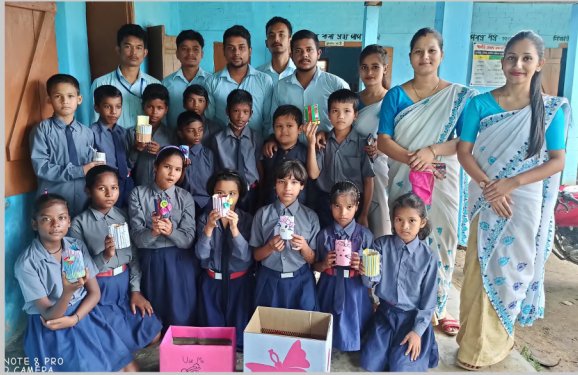
DEMONSTRATING SELF MADE COLLAGE