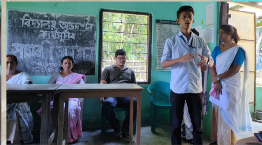
CLOSING CEREMONY OF SIP