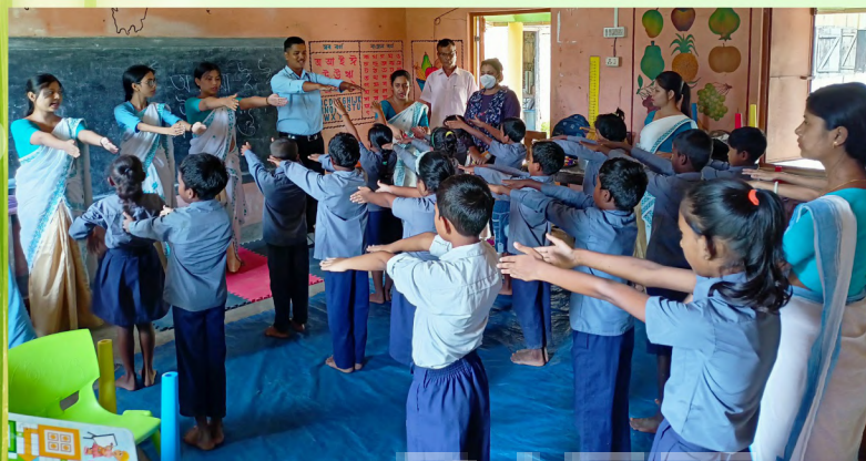
PRACTISING OF MARCH PAST FOR INDEPENDENCE DAY