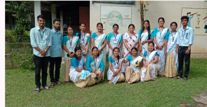
TEACHER TRAINEES WITH THEIR MENTOR