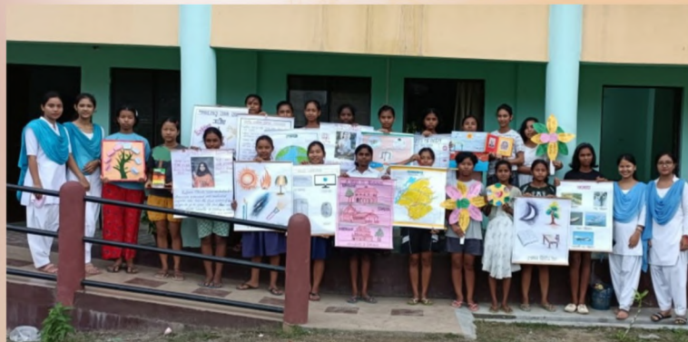
Kasturba Gandhi Balika Vidyalaya