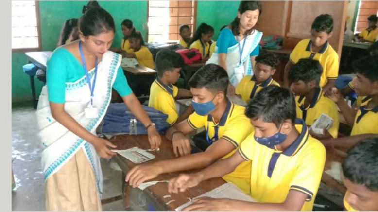
ENVELOPE MAKING TAUGHT BY OUR TRAINEES