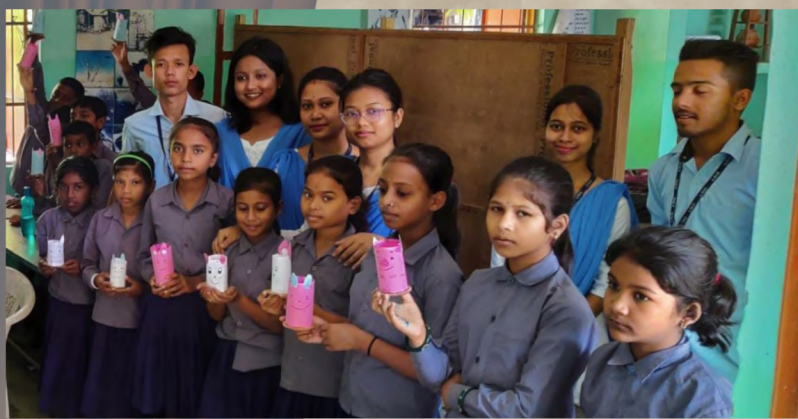
ART AND CRAFTS MADE BY STUDENTS