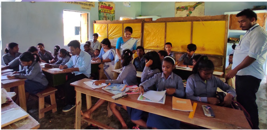
CONDUCTING ART AND CRAFTS CLASS IN THE SCHOOL