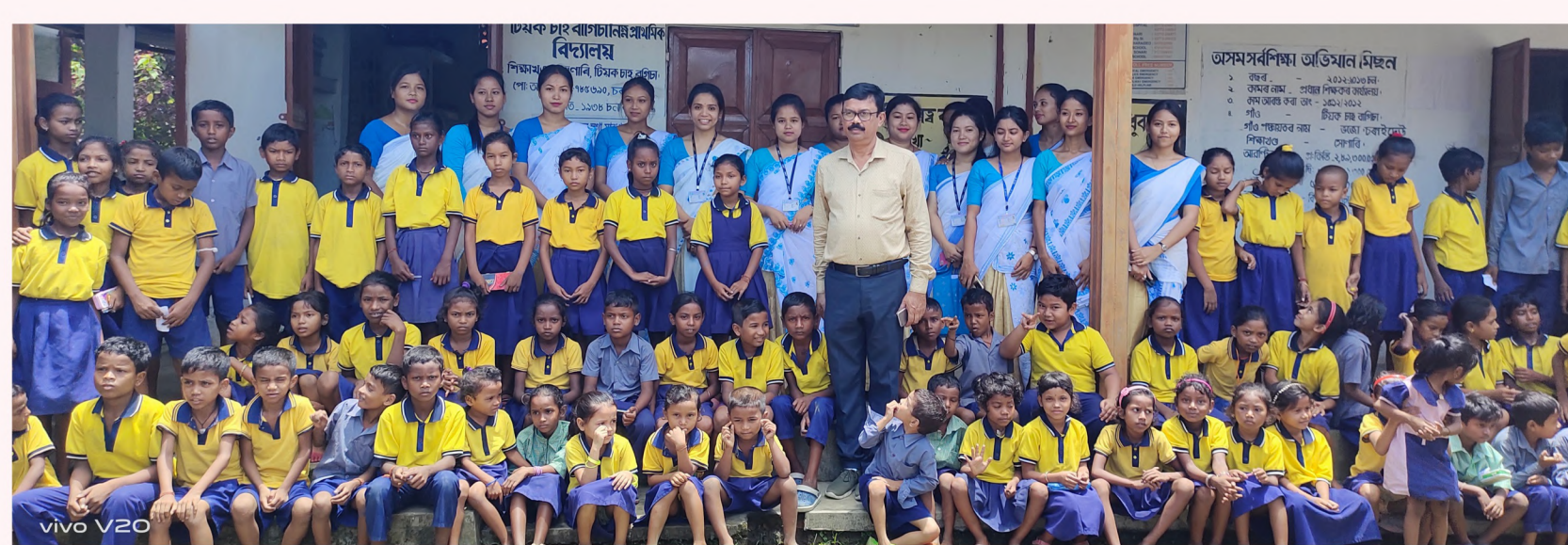
A PICTURE OF STUDENT, TEACHER TRAINEES AND MENTOR