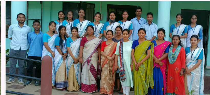
MENTOR, TRAINEES AND TEACHERS' AT ASSIGNED SCHOOL