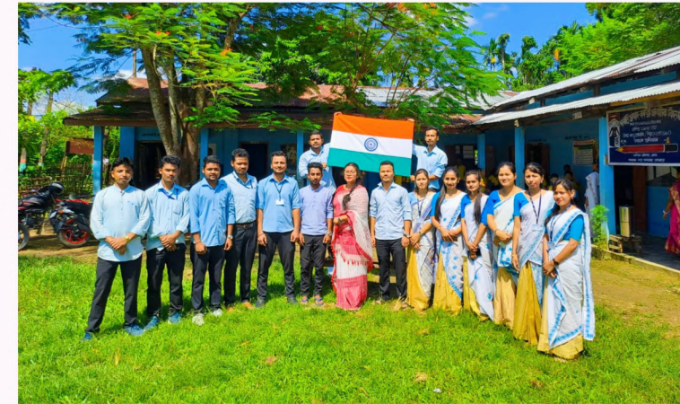
MENTOR AND TEACHER TRAINEES WITH THE NATIONAL FLAG OF INDIA