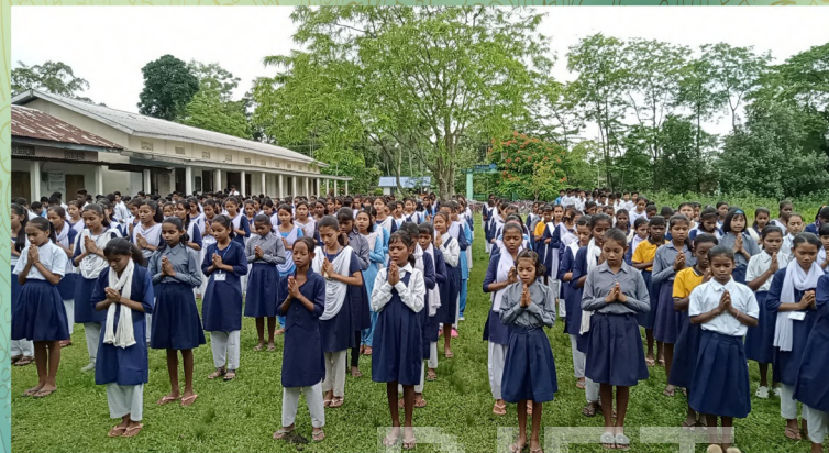
CONDUCTING MORNING ASSEMBLY IN THE SCHOOL