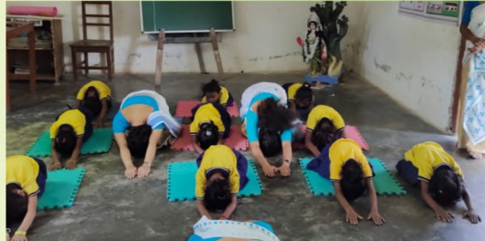
IN A MOMENT OF TEACHING YOGA