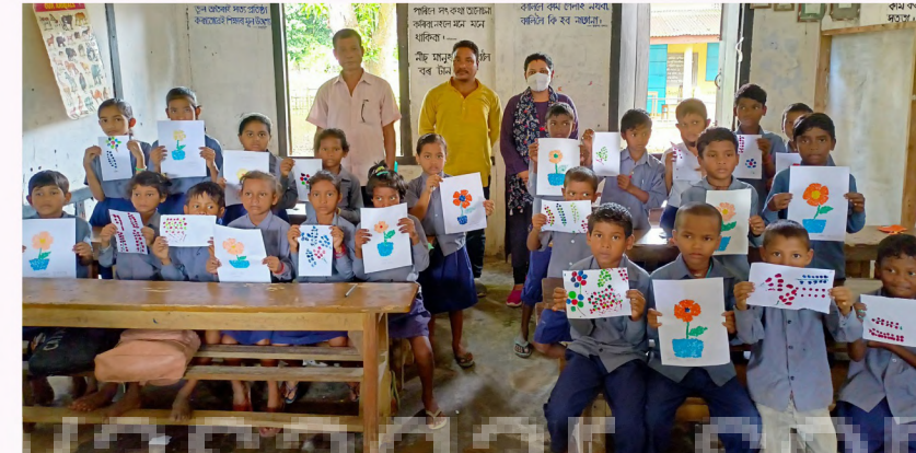
STUDENTS WITH THEIR COLLAGE AND FINGER PAINTINGS