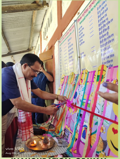
INAUGURATION OF WALL MAGAZINE BY THE PRINCIPAL DIET