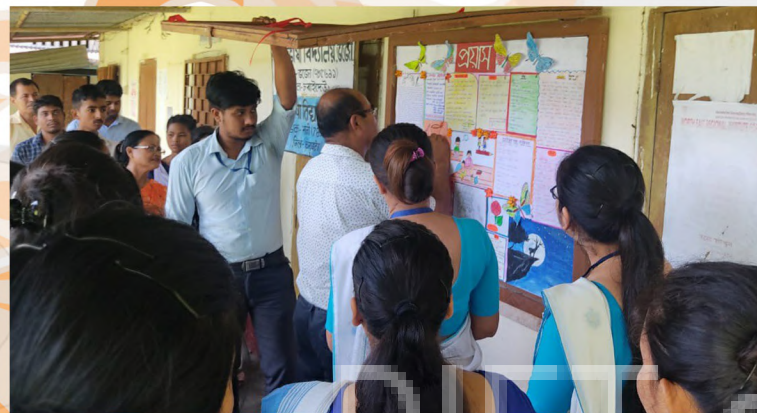
AT THE MOMENT OF INAUGURATING WALL MAGAZINE