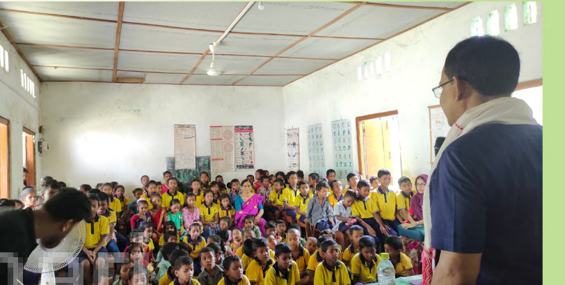
ADDRESSING STUDENTS,TEACHERS ,TEACHER TRAINEES BY THE PRINCIPAL AT THE CLOSING CEREMONY