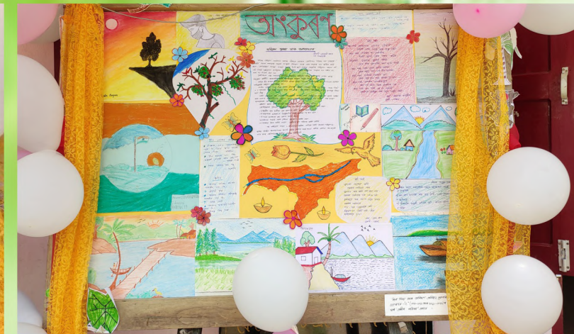
WALL MAGAZINE DISPLAYING THE POTENTIAL OF STUDENTS