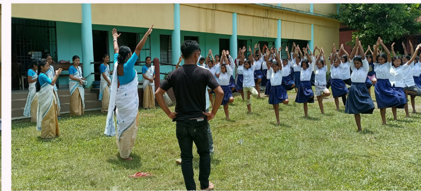
TEACHING YOGA AT SCHOOL