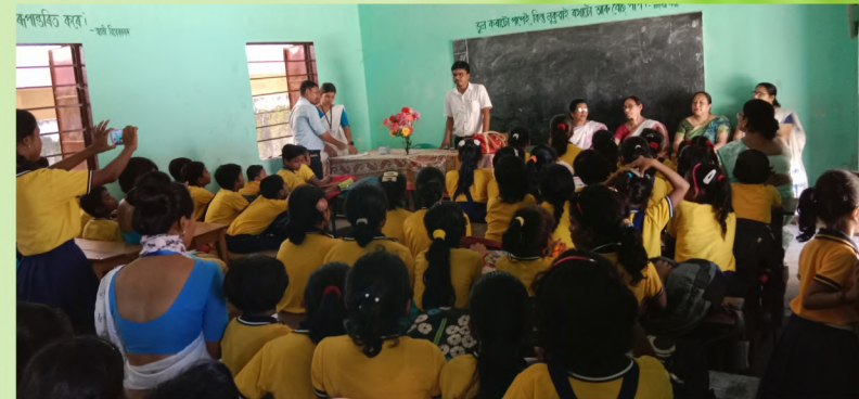
CLOSING CEREMONY OF SIP