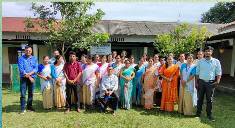
MEMORABLE MOMENT OF SIP SCHOOL