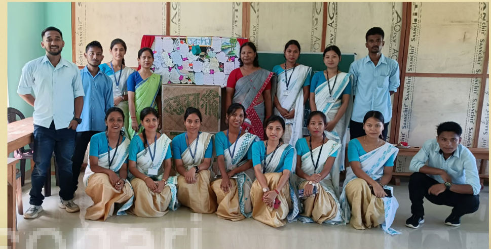
MEMORABLE MOMENT OF SIP