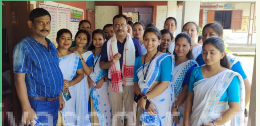
IN A PLEASANT MOMENT TRAINEES WITH PRINCIPAL DURING SIP