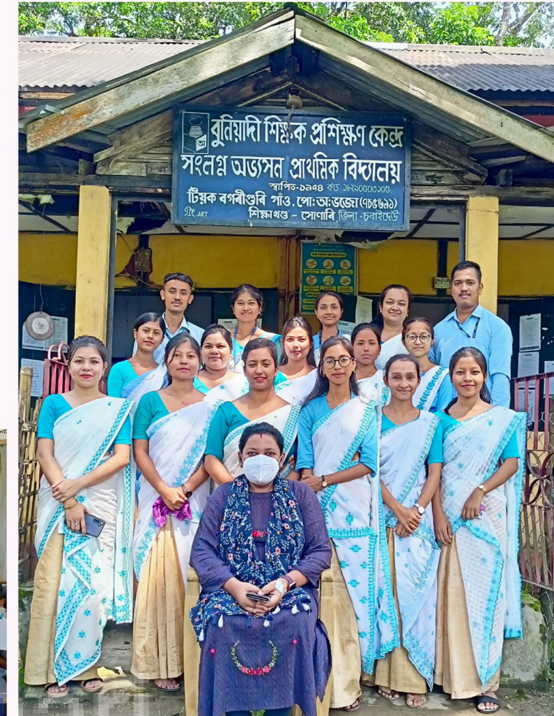
IMAGE OF MENTOR AND TRAINEES