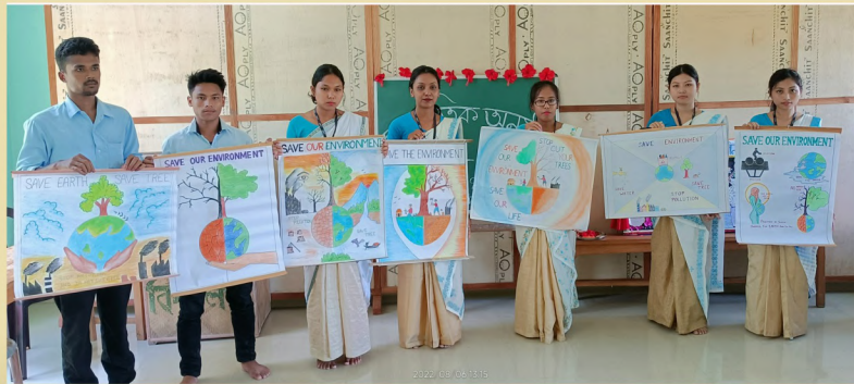
AWARENESS ACTIVITIES ON GREEN SCHOOL CAMPAIGN