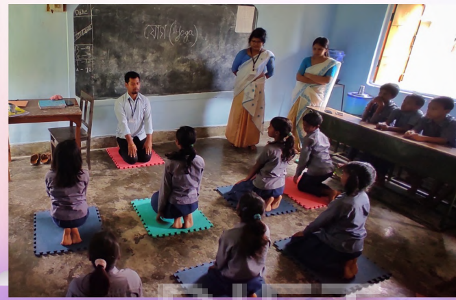
YOGA TAUGHT TO THE THE STUDENTS BY OUR TRANIEES