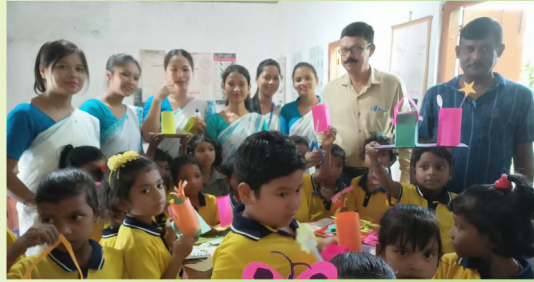
JOYFUL MOMENT OF STUDENTS SHOWING THE SELF MADE MATERIALS