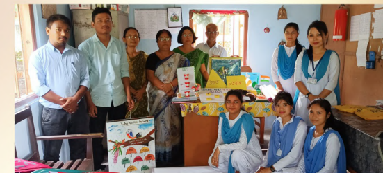
Rajadhap LP School