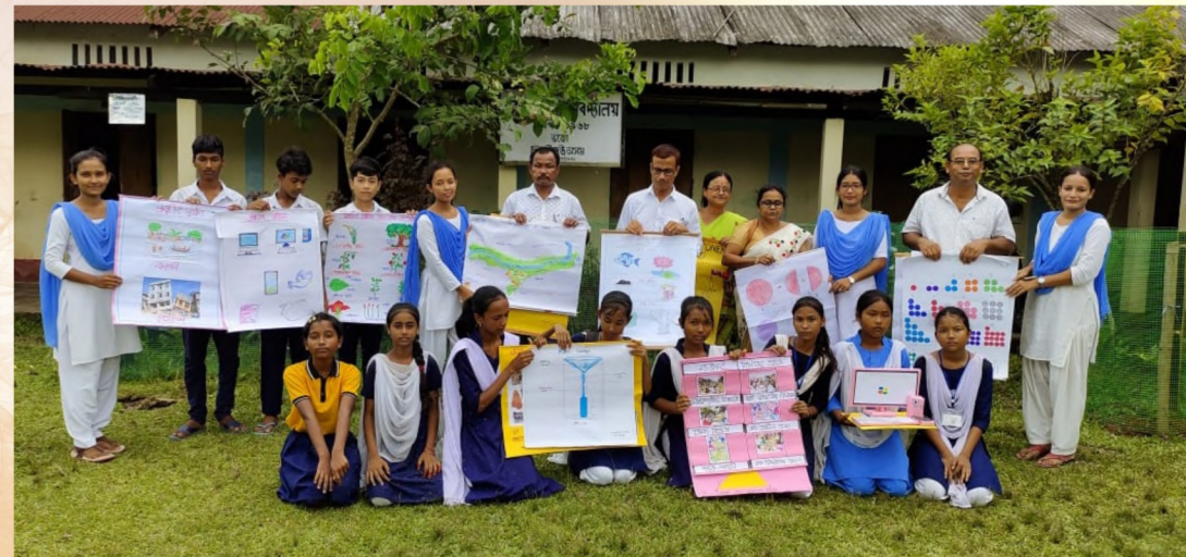
Bhojo High School