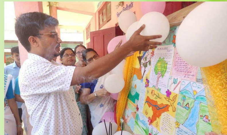
UNVEILING OF THE WALL MAGAZINE IN THE SCHOOL