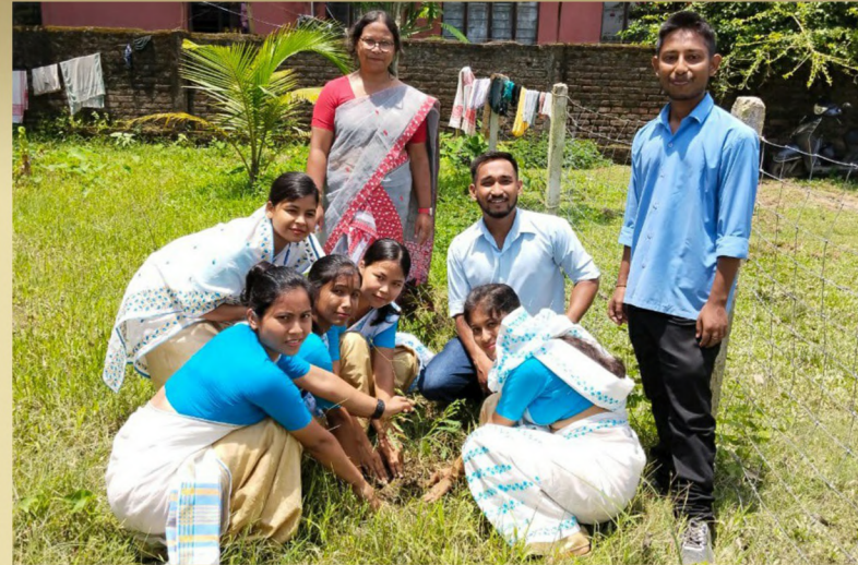
CHEERFUL MOMENT OF PLANTATION