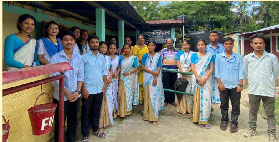
IN A PLEASANT MOMENT WITH MENTOR