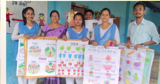
Parbati Prashad Boruah Pathamik Vidyalaya