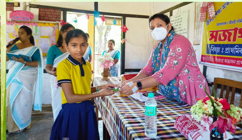
PRESENTATING OF AWARD TO THE STUDENT