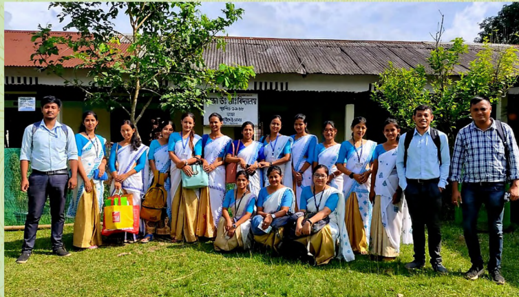
TEACHER TRAINEES WITH THEIR MENTOR