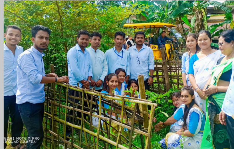
TEACHER TRAINEES DURING TREE PLANTATION IN THE SCHOOL