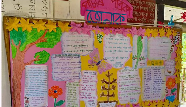
IMAGE OF BEAUTIFUL WALL MAGAZINE