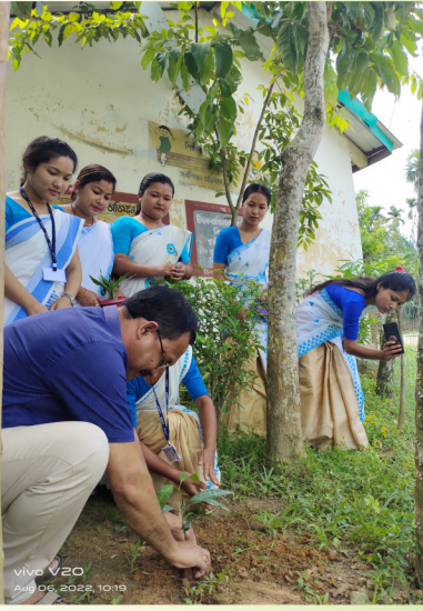
PLANTATION DONE BY THE PRINCIPAL