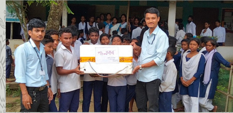
PREPARATION OF GARDEN COMPOST.