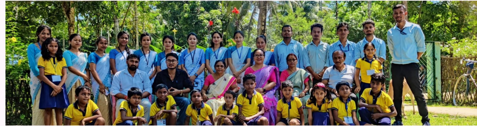
MENTOR, TEACHER TRAINEES, TEACHERS' AND STUDENTS