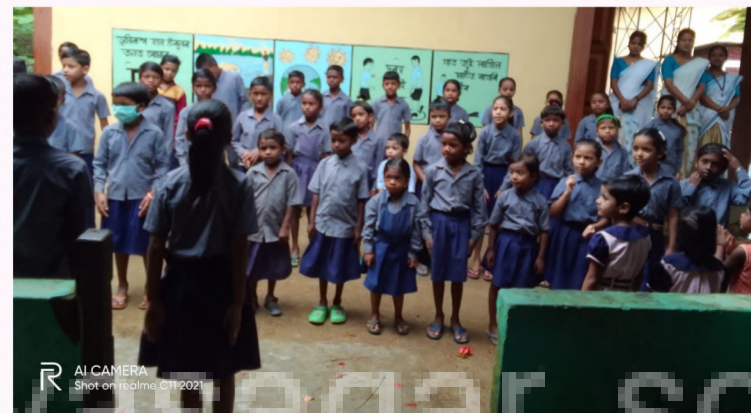
CONDUCT OF MORNING ASSEMBLY IN THE SCHOOL