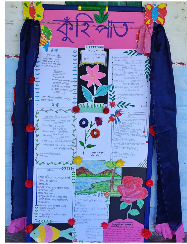
WALL MAGAZINE DISPLAYING THE POTENTIAL OF STUDENTS