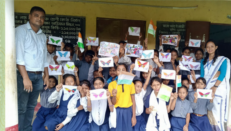
DEMONSTRATING SELF MADE COLLAGE IN PRESENCE OF MENTOR