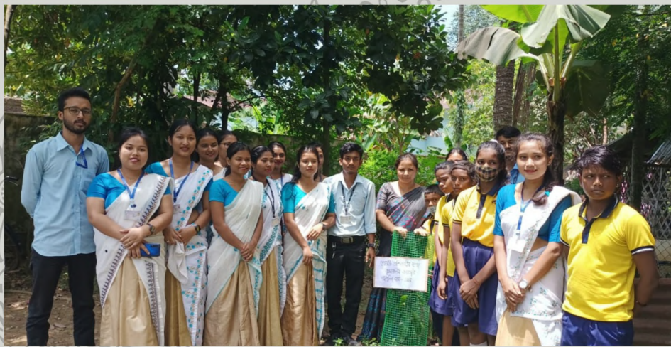
TREE PLANTATION PROGRAMME