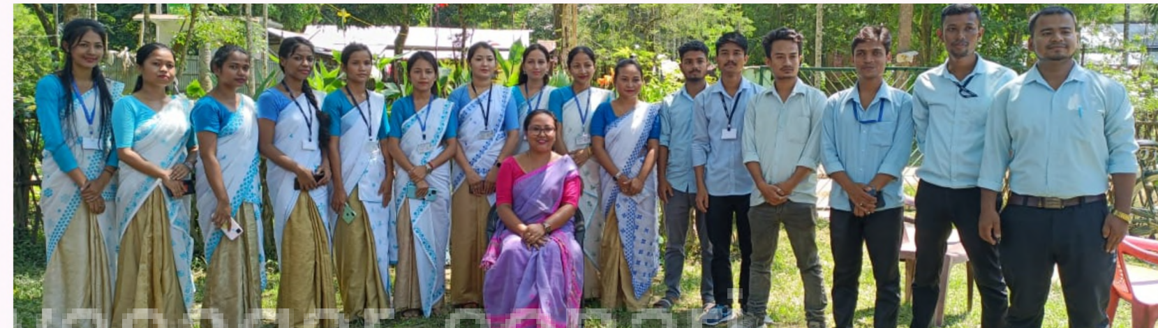
TEACHER TRAINEES WITH MENTOR