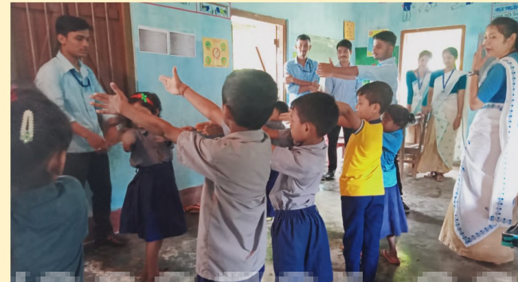
PHYSICAL ACTIVITIES ARE GOING ON