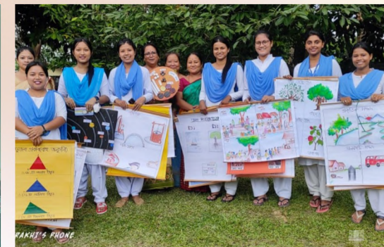
Rajadhap ME school