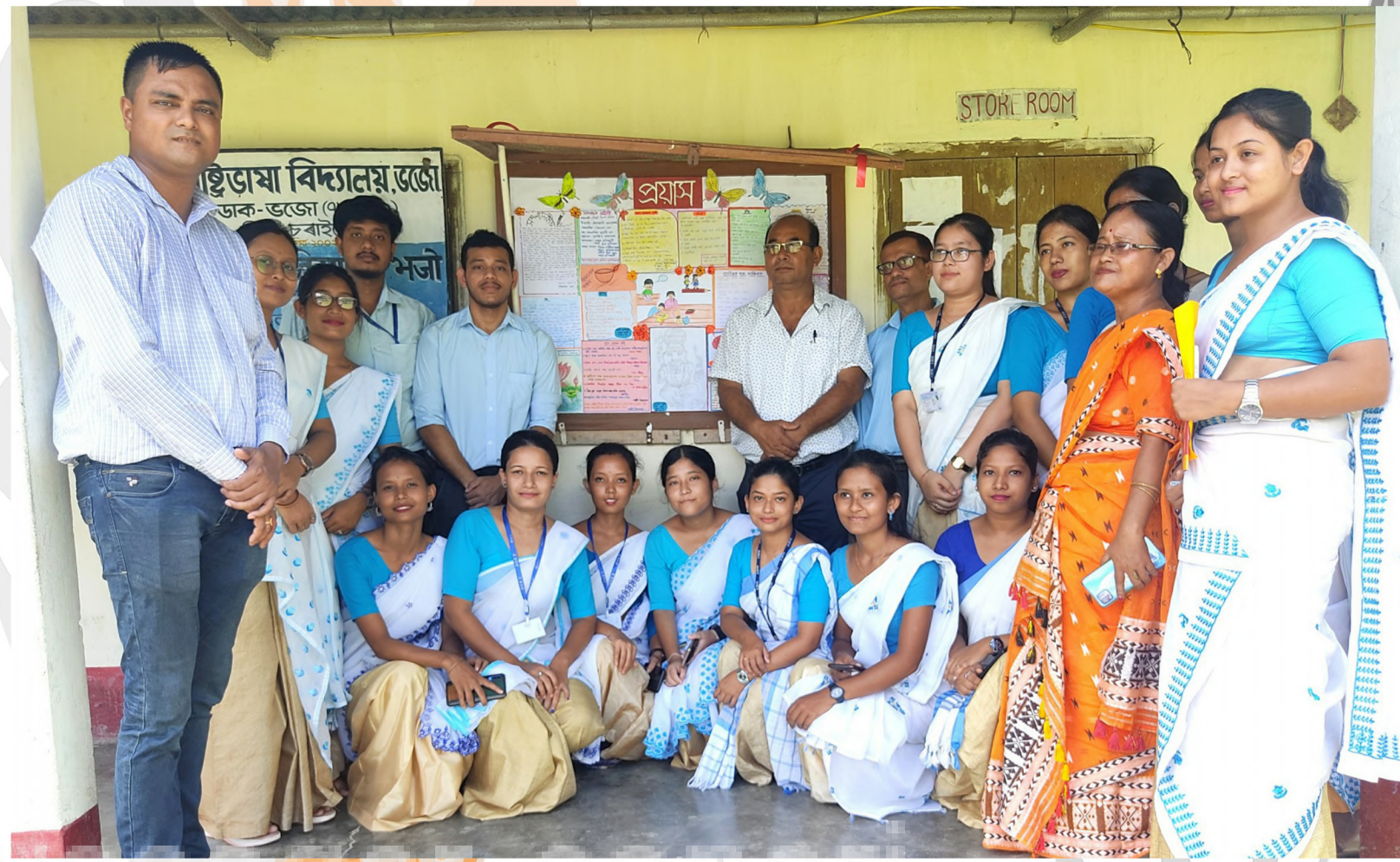
IN A PLEASANT MOMENT TRAINEES WITH MENTOR