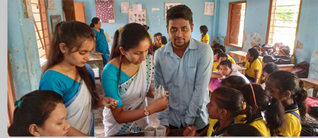
TEACHER TRAINEES AND STUDENTS WITH THEIR ART WORK