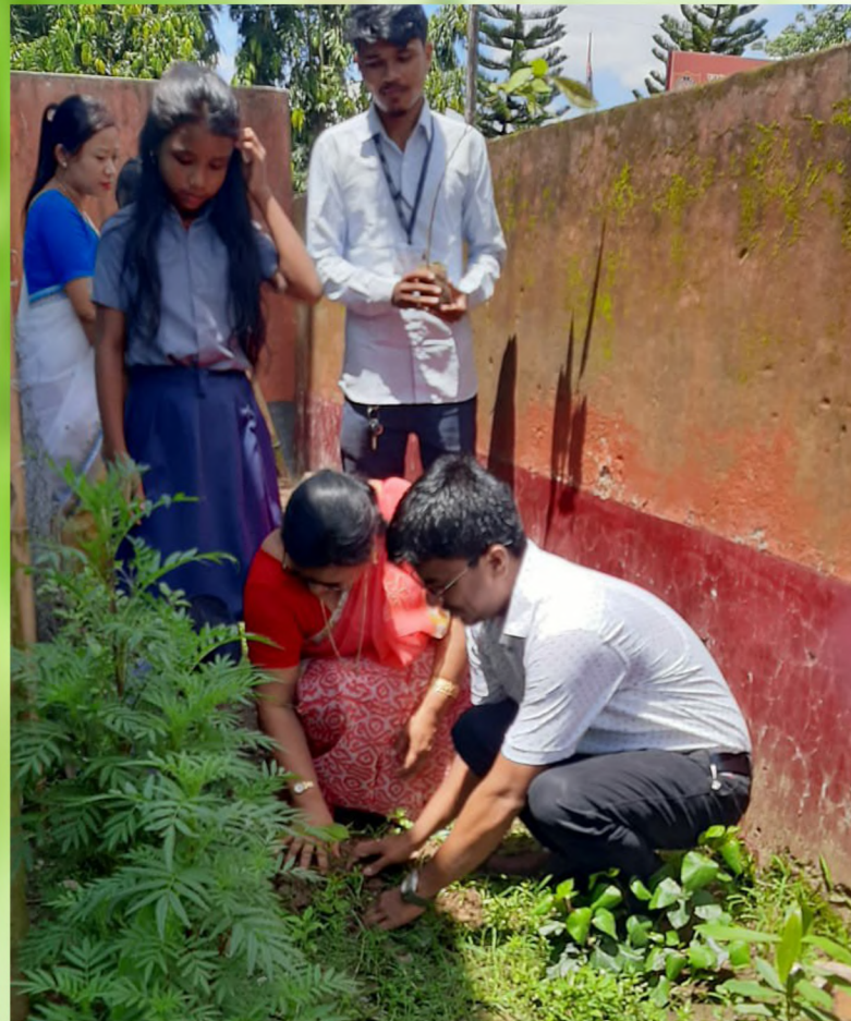
TREE PLANTATION PROGRAMME IN THE SCHOOL