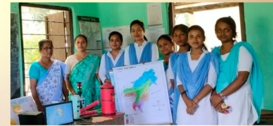
542 no Tiok Bogoriguri LP School