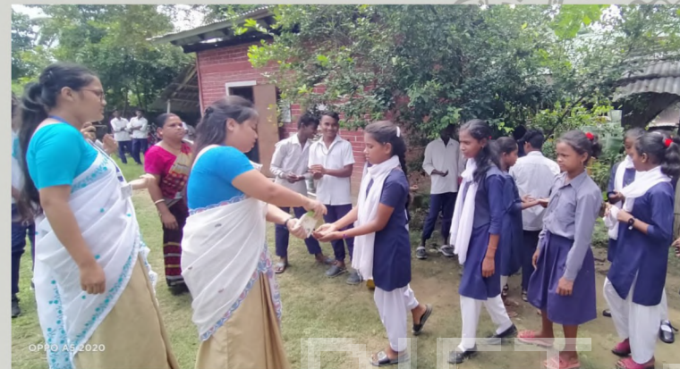
MAINTENANCE OF HEALTH AND HYGIENE AMONG STUDENTS