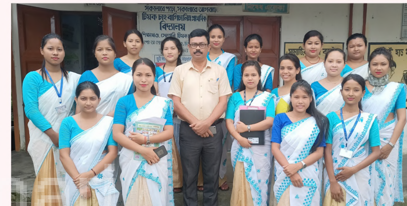
IN A PLEASANT MOMENT TRAINEES WITH MENTOR