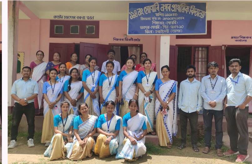
TEACHERS', TEACHER TRAINEES AND MENTOR IN THE SCHOOL