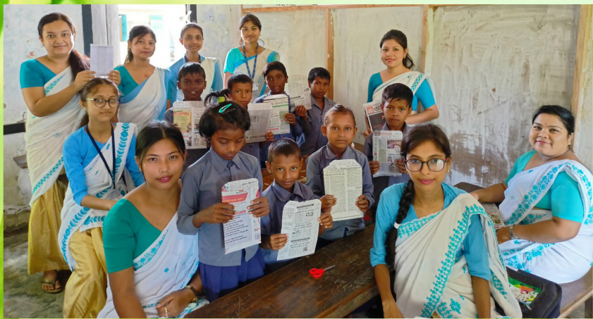
ENVELOPE MAKING TAUGHT BY OUR TRAINEES