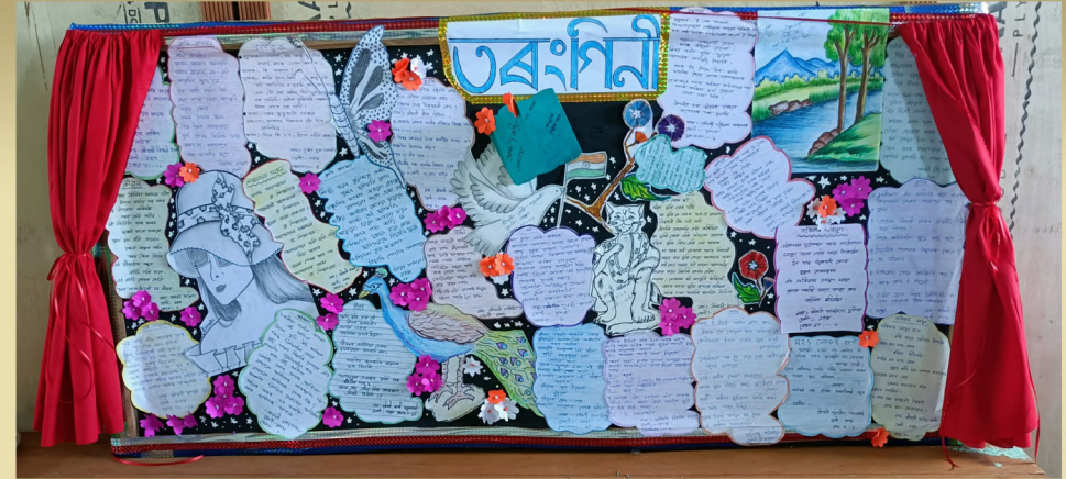
OVERVIEW OF WALL MAGAZINE