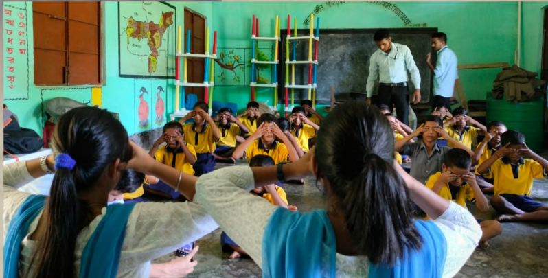
ORGANIZATION OF YOGA BY OUR TRAINEES