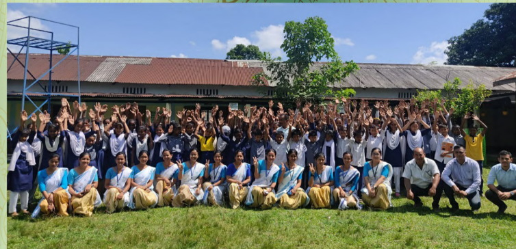
TEACHER TRAINEES, TEACHERS' WITH MENTOR