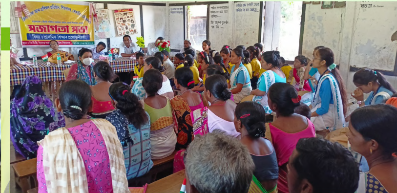
IMAGE OF THE MENTOR INTERACTING WITH THE PARENTS OF THE SCHOOL