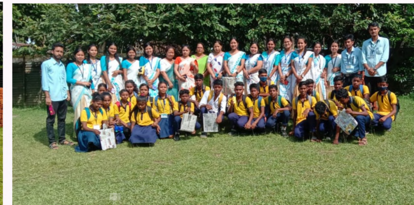
DEMONSTRATION OF SELF MADE ARTICLES BY THE STUDENTS