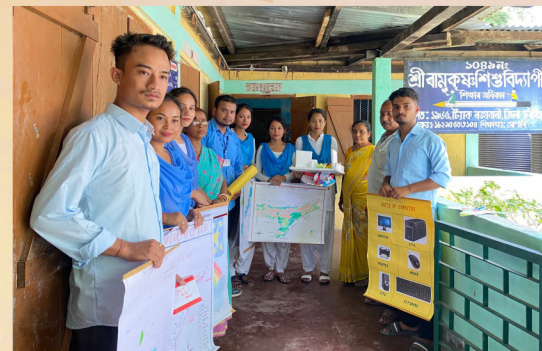
1049 no Sri Ramkrishna Sisu Bidya Pith