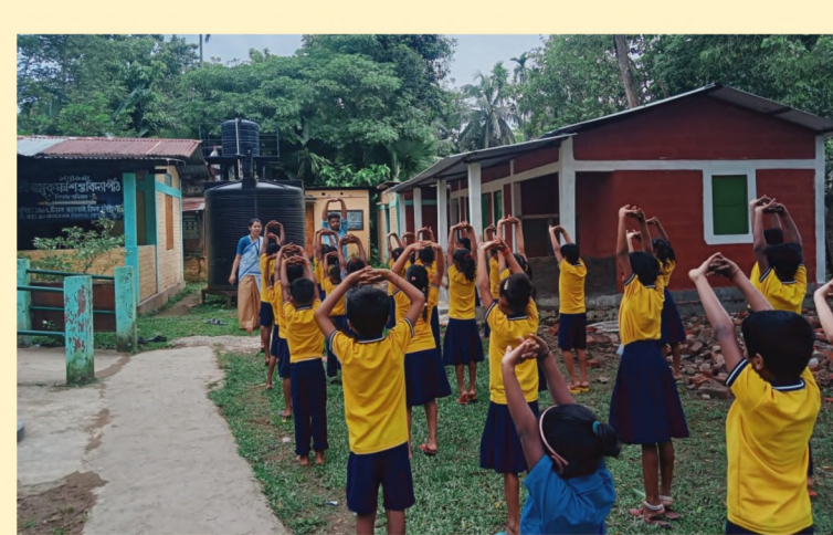
A MOMENT WHILE PRACTICING YOGA