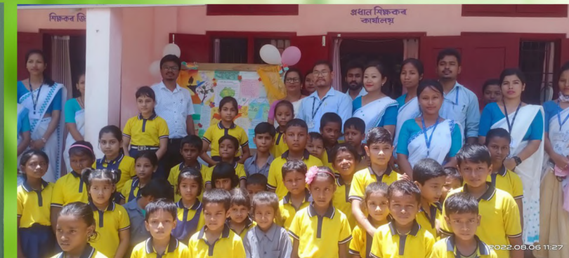
IN A PLEASANT MOMENT TEACHER TRAINEES, TEACHERS AND STUDENTS WITH MENTOR