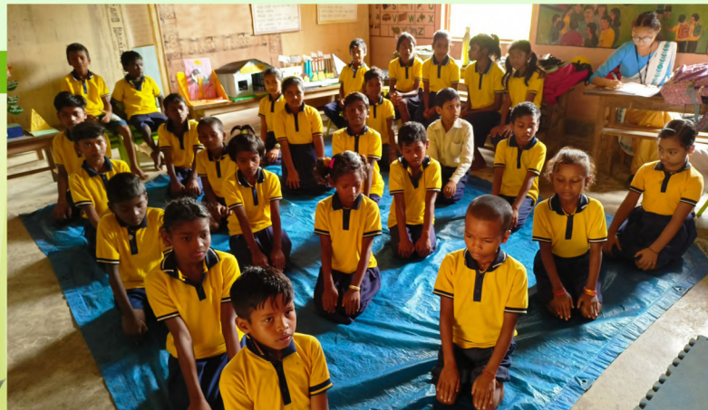
YOGA COMPETITION HELD IN THE SCHOOL