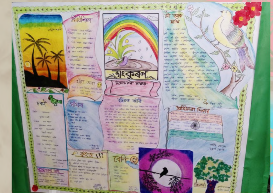
WALL MAGAZINE SHOWCASING THE TALENT OF STUDENTS