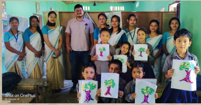
COLLAGE ART PREPARED BY STUDENTS