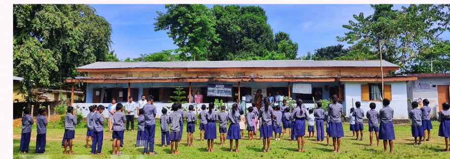
CONDUCTING MORNING ASSEMBLY IN THE SCHOOL