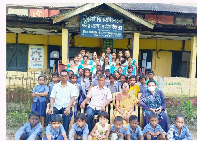
MENTOR, TRAINEES, TEACHERS AND STUDENTS