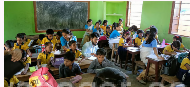
CONDUCTING OF AN ACTIVE CLASS BY OUR TRAINEES