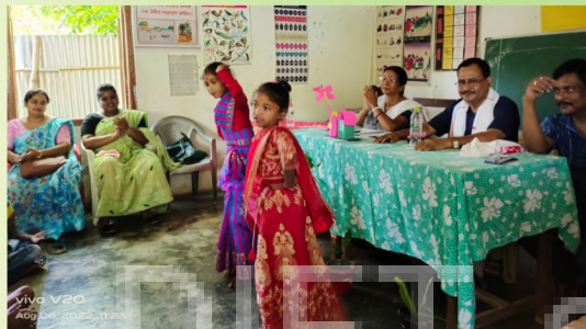
CULTURAL ACTIVITY BY THE STUDENTS