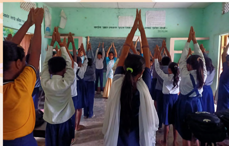
IN A MOMENT PRACTICING YOGA