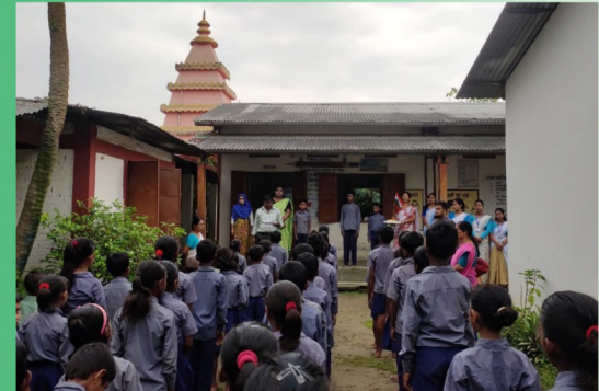
DURING THE TIME OF CONDUCT OF MORNING ASSEMBLY