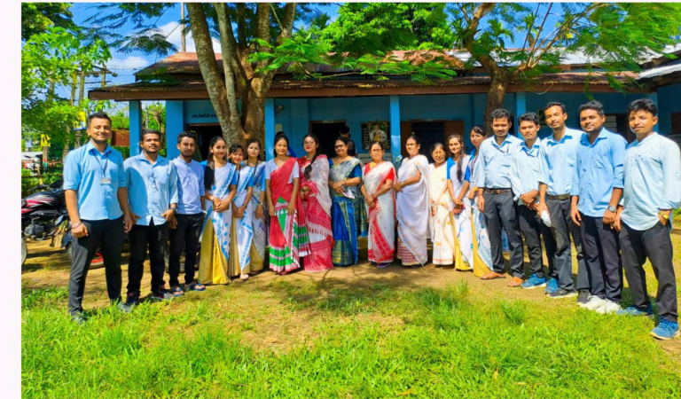
MENTOR, TEACHERS' AND TRAINEES