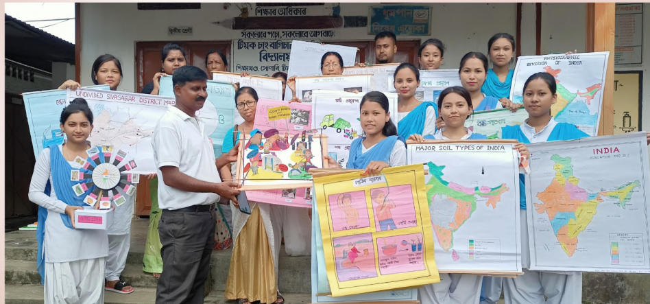
Teok Bagisa LP School