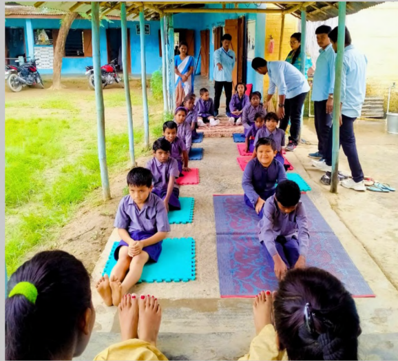
CONDUCTING OF PHYSICAL ACTIVITIES IN THE SCHOOL