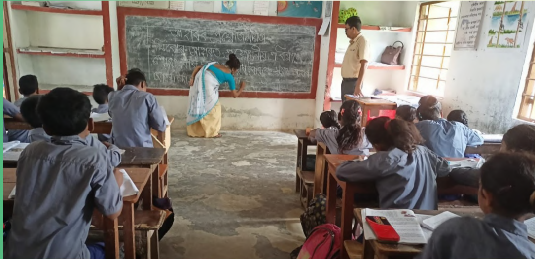
CLASSROOM TRANSACTION IN PRESENCE OF MENTOR