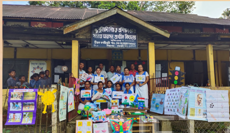
B.T.C. Practicing LP School