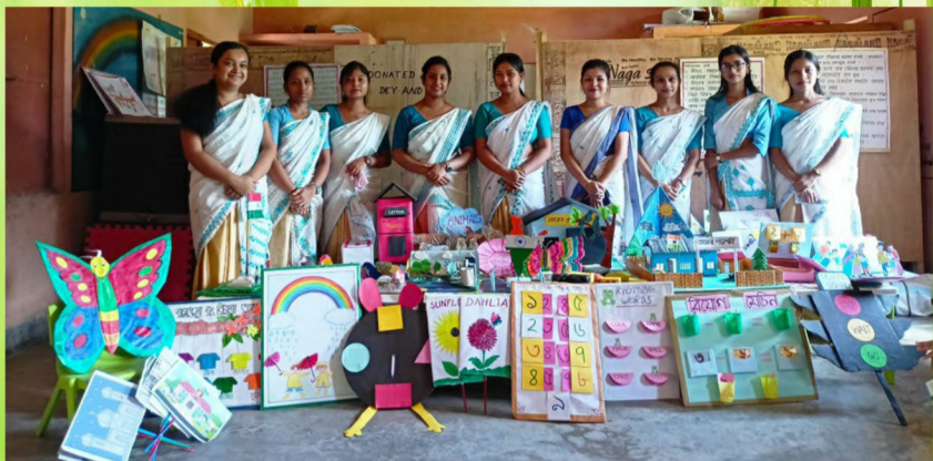
OUR TRAINEES WITH THEIR BEAUTIFUL TLMs MADE FOR THE STUDENTS OF THE SCHOOL