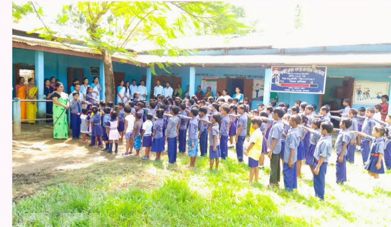
CONDUCTING MORNING ASSEMBLY IN THE SCHOOL