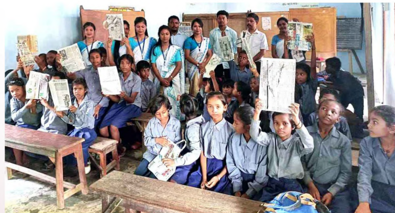
DEMONSTRATION OF SELF MADE ARTICLES BY THE STUDENTS