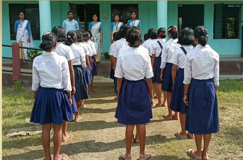
CONDUCTED MORNING ASSEMBLY DURING SIP