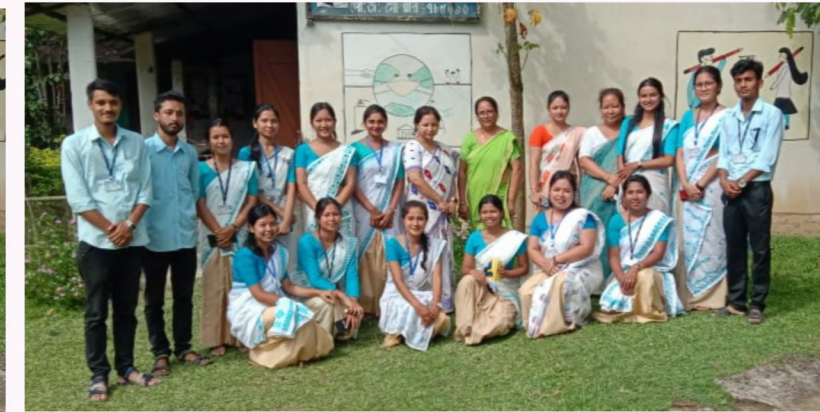
MENTOR, TEACHERS' AND TEACHER TRAINEES