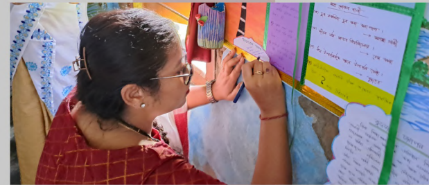
APPRECIATION OF WALL MAGAZINE CREATED BY STUDENTS OF THE SCHOOL