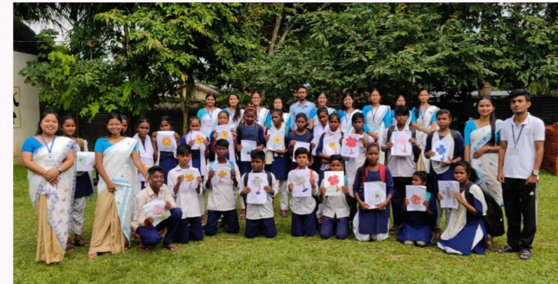
DISPLAY OF ART WORK