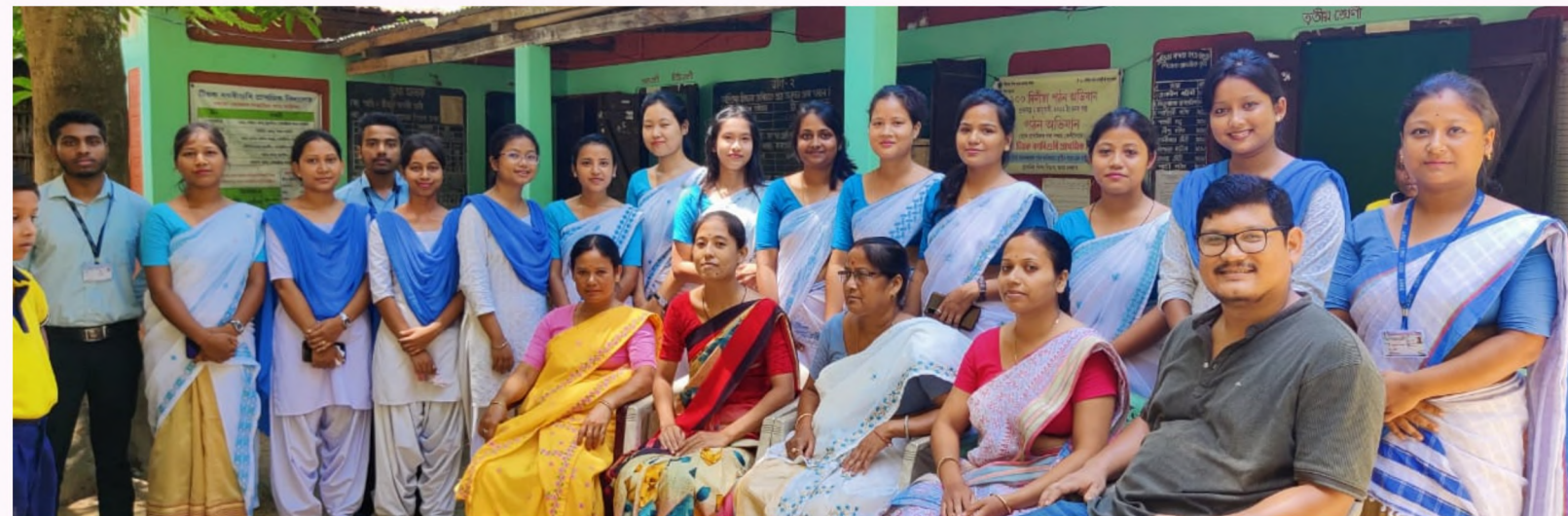
MENTOR, TEACHER TRAINEES AND TEACHERS' AT ASSIGNED SCHOOL