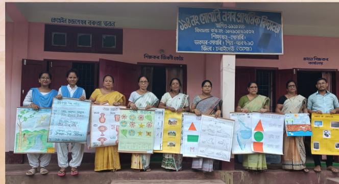
194 no Sonari Nagar Prathamik Vidyalaya