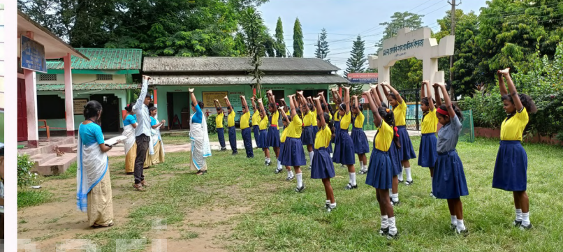
PRACTICE OF PHYSICAL ACTIVITIES