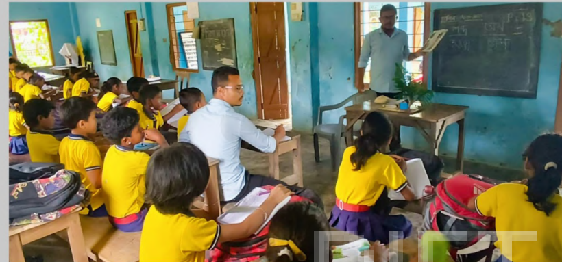
IMAGE OF A TEACHER TRAINEES CONDUCTING A CLASS IN THE SCHOOL