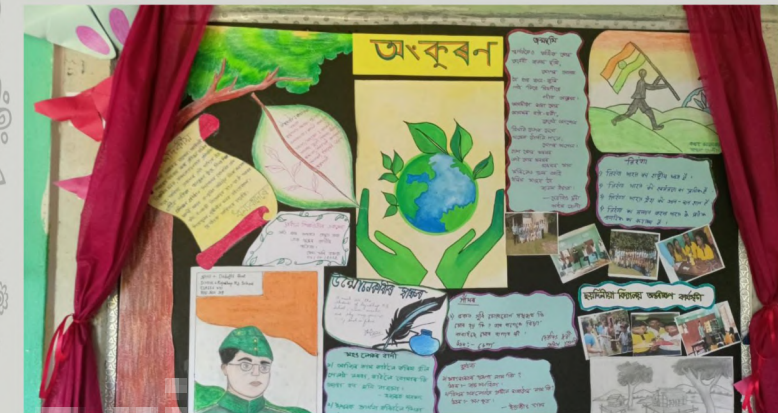
WALL MAGAZINE IN THE SCHOOL