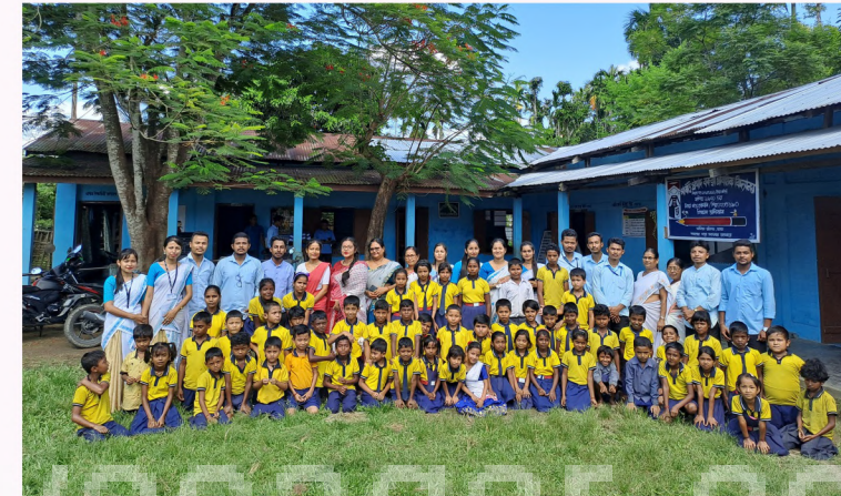
IMAGE OF MENTOR, TEACHER TRAINEES, TEACHERS' AND STUDENTS OF THE SCHOOL