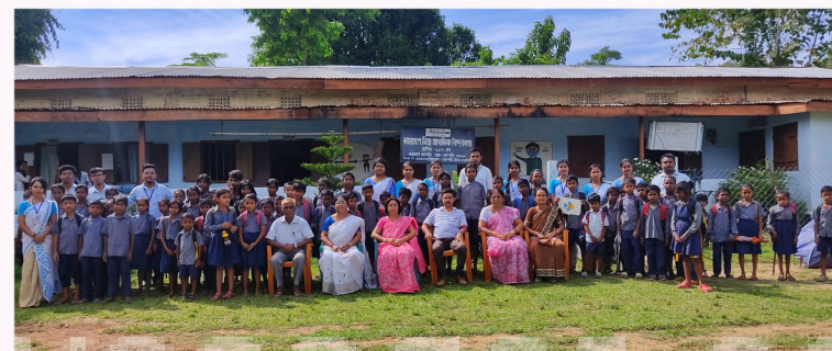
MENTOR, TRAINEES, TEACHERS' AND STUDENTS OF THE SCHOOL