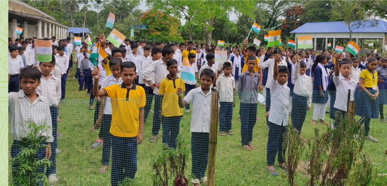
ASSEMBLY DEDICATED TO THE AZADI KA AMIT MAHOTSAV