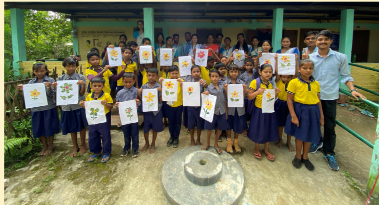
DEMONSTRATING SELF MADE COLLAGE IN PRESENCE OF MENTOR