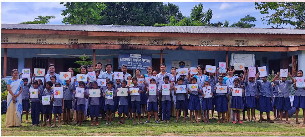
IMAGE OF THE MENTOR, TRAINEES AND STUDENTS OF THE SCHOOL WITH THEIR BEAUTIFUL COLLAGE ART