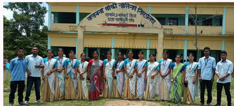
TEACHER TRANIEES WITH MENTOR