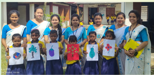
DEMONSTRATING SELF MADE COLLAGE