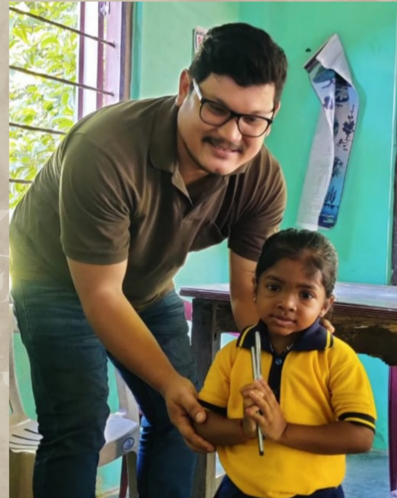
PRIZE DISTRIBUTION HEADED BY THE MENTOR