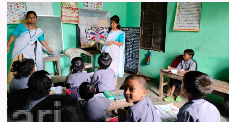
CLASSROOM TRANSACTION USING TLM