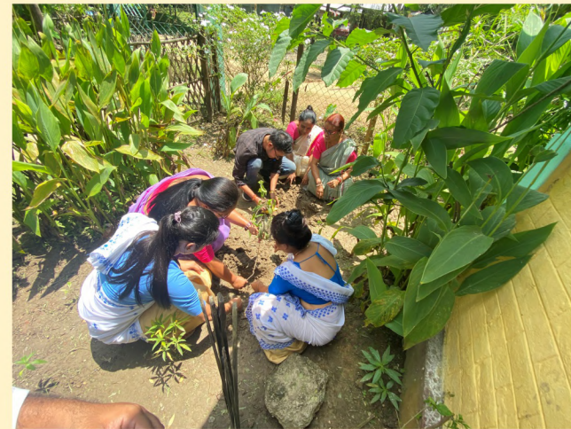
PLANTATION DONE BY OUR TRAINEES