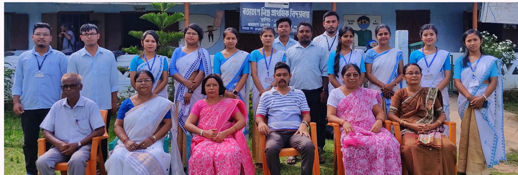
TEACHER TRAINEES, TEACHERS' WITH MENTOR