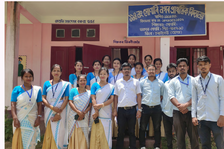
MENTOR AND TEACHER TRAINEES IN THE SCHOOL